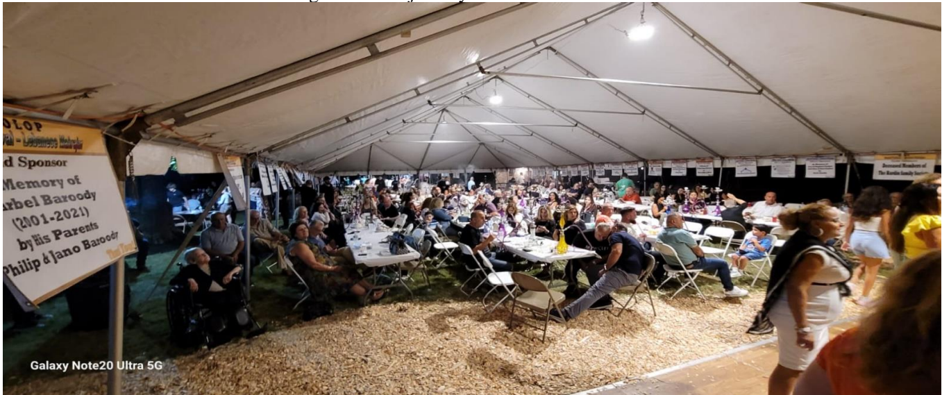
Galaxy Note20 Ultra 5G

We have much to look forward to as we begin this new journey of faith.